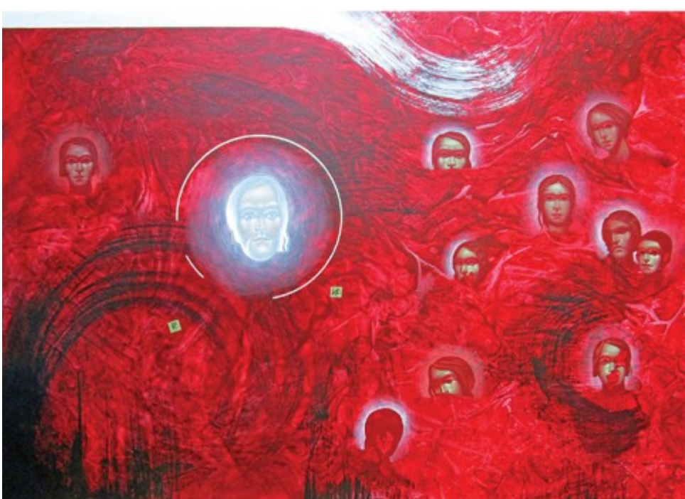
(Used by permission of the artist and ICONART Contemporary Sacred Art Gallery)