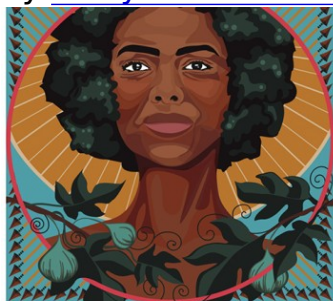
Eve: Mother of All Life