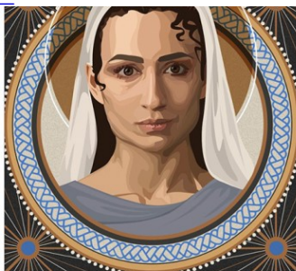
Martha of Bethany