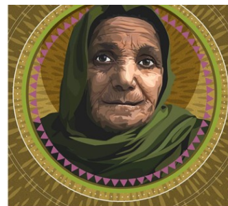
Anna The Prophet