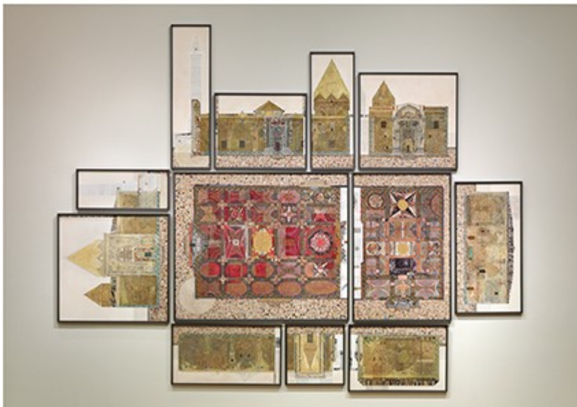
Drawings of Chartres Cathedral in France and the Grand Mosque in Divriği, Turkey, from The Anastylis Project

Mary Griep's The Anastylis Project presents detailed small-scale drawings of great buildings which somehow convey the wonder and significance of the buildings themselves. Anastylis is a Greek term meaning "the restoration of a ruined building by reassembling the constituent parts." It's a word that might have been created just for this project, in which the exterior of Chartres Cathedral was studied, photographed, and painstakingly drawn to create a 10-foot-by-14-foot wall display. Re-creating the cathedral at scale (24:1 inch) is a feat of art, mathematics,