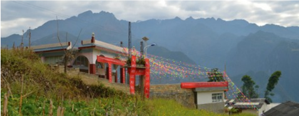
Latudi Village Church in China.

by Lian Xi in the September 30, 2015 issue