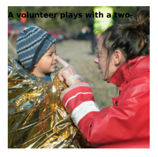
year-old refugee who's just arrived.